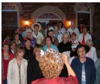
The chorus in harmony