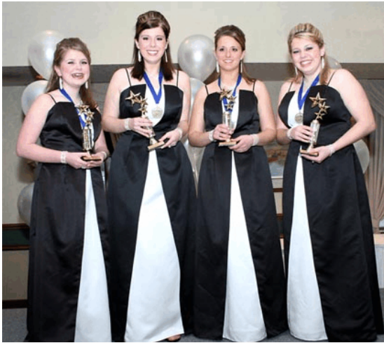
CHROMATIX 2007 Four-Star Harmony Champions