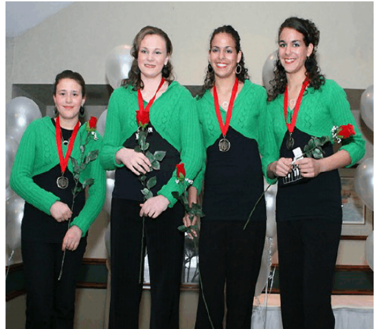
Melody Sisters Second Place Winners